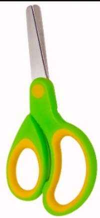
1 pair of scissors