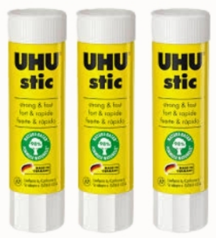
3 jumbo glue sticks