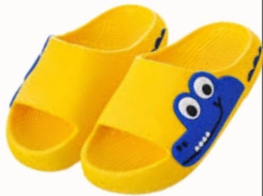
1 pair of slip-on slippers