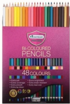
1 box 48 color pencils