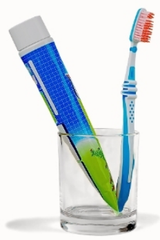
toothbrush toothpaste and a cup