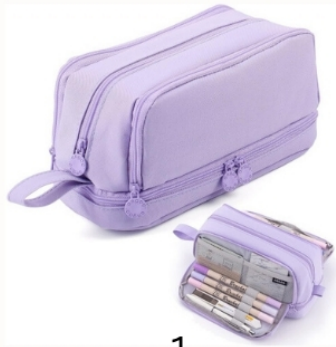
1 large pencil case with compartments and handle