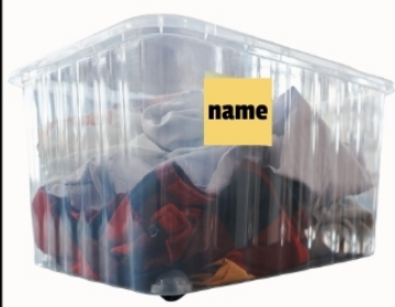
1 box of extra clothes