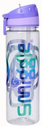
1 clear water bottle