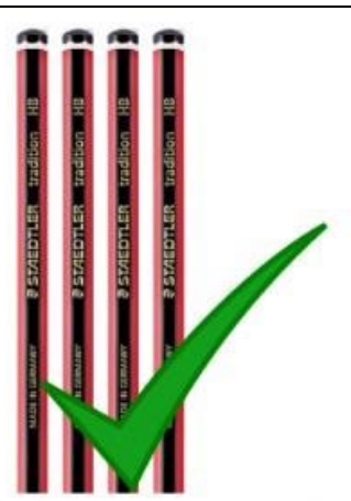
Students should use pencils without erasers.

Students accidentally poke themselves or their friends when they try to erase something.